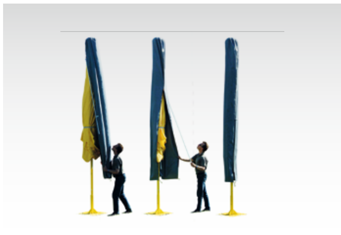
Protective cover Ripstop®