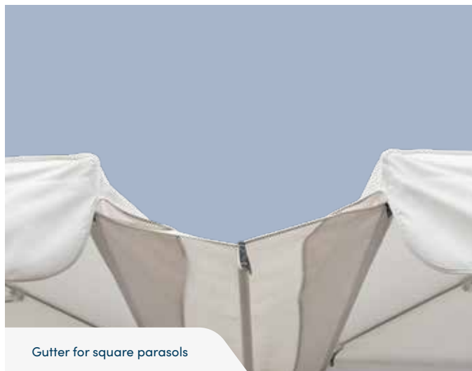
Gutter for square parasols