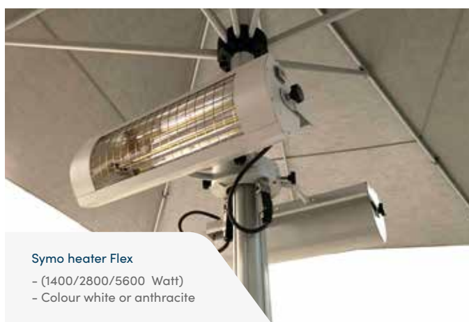
Symo heater Flex - (1400/2800/5600 Watt) - Colour white or anthracite